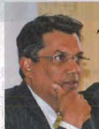
Rajeshwar Jeetah, Minister of Tertiary Education, Science, Research & Technology