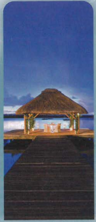
Quality of life

“In Mauritius there is TIME for business, TIME for people, TIME for family and TIME to appreciate life.”