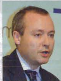
Nick Leake, British High Commissioner for Mauritius

Minister Navinchandra Ramgoolam is famously dedicated to democracy because "it provides a stable platform for investment," he says. And with much of the world in recession or crisis, Mauritius remains ahead of the curve.