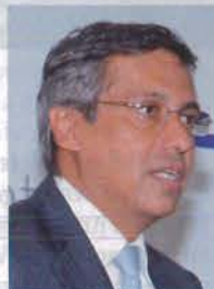
Charles Gaëtan Xavier-Luc Duval, Vice-PM & Min of Finance & Economic Devpt.

The country of just over 1.2 million has been heralded as the best-governed nation on the African continent for the last five years. Prime