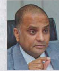
Tassarajen Pillay Chedumbrum Minister of ICT

Business Parks of Mauritius Ltd. (BPML), a government-owned infrastructure-development company, was incorporated in March 2001 to spearhead the development of intelligent buildings and business parks in Mauritius. The creation of BPML was a key initiative of the government's vision to transform the Mauritian economy into an