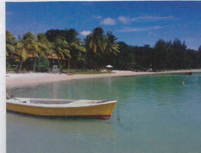
Cove near Grand Baie, Mauritius

and serving the nation. We have managed to get back on the path toward recovery and sustained profitability without any bailout."