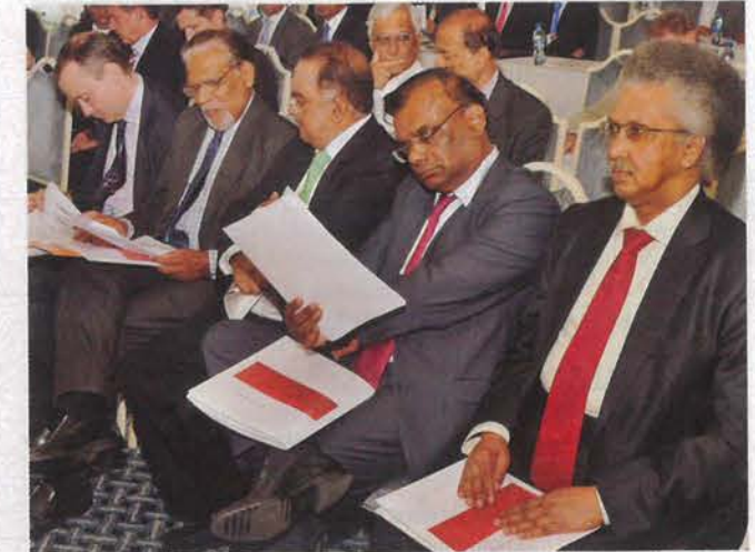
Front row of the Business Outlook Leadership Series Forum

"Our port provides a very safe, quick and efficient transshipment