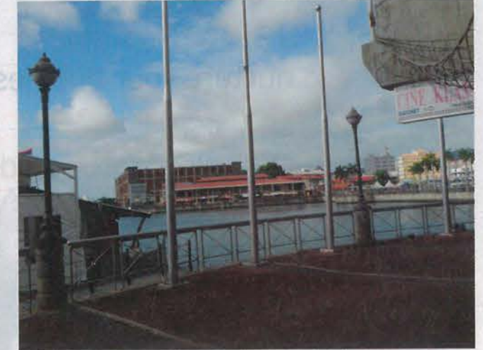
Le Caudan Waterfront, Port Louis, Mauritius

Salient features of the plan include terminal extensions to cater to up to 10 million passengers, the construction of a second runway, a